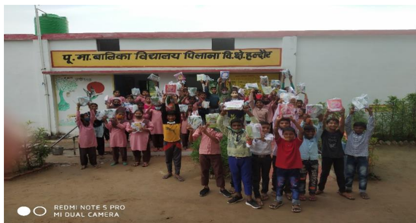
Pic. 1: Students of Upper Primary School, Pilana after stationery distribution drive