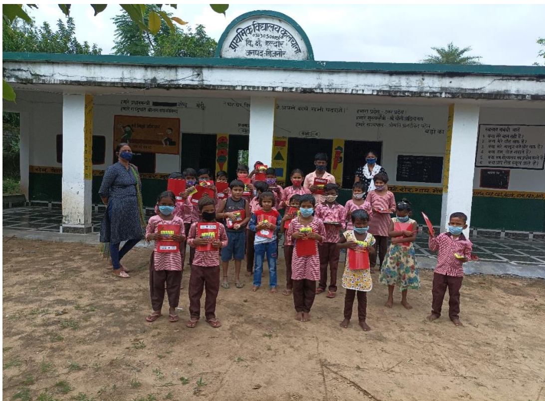
Pic. 2: Students of Primary School, Kulchana after stationary distribution drive