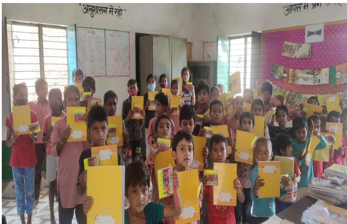
Pic. 3: Students of Primary School, Mithanpur after stationary distribution drive